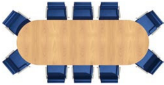
Size: 3500 x 1200mm Seats: 10