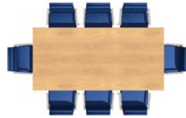
Size: 2500 x 1200 Seats: 8