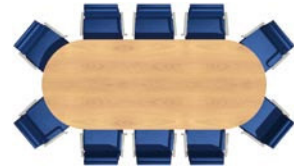
Size: 3000 x 1200mm Seats: 8/10