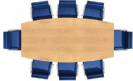
Size: 2500 x 1200mm Seats: 8