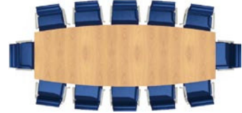
Size: 3500 x 1200mm Seats: 10/12