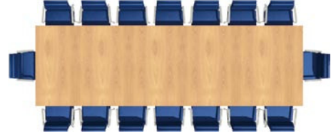
Size: 5000 x 1500mm Seats: 16