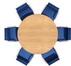
Size: 1500mm diam. Seats: 6