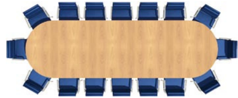
Size: 5000 x 1500mm Seats: 14/16