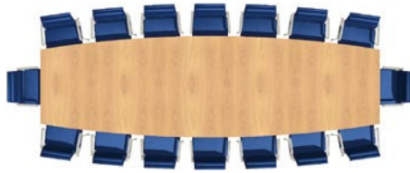
Size: 5000 x 1500mm Seats: 16