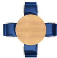
Size: 1200mm diam. Seats: 4