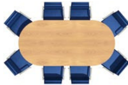
Size: 2500 x 1200mm Seats: 6/8