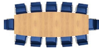
Size: 3500 x 1200mm Seats: 10/12