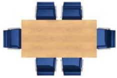
Size: 2000 x 1000mm Seats: 6