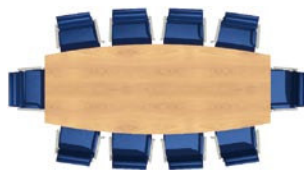
Size: 3000 x 1200mm Seats: 8/10