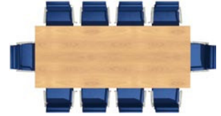
Size: 3000 x 1200mm Seats: 10