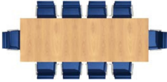
Size: 3500 x 1200mm Seats: 10