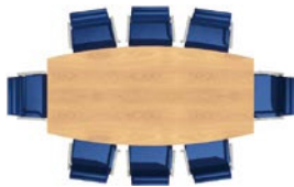
Size: 2500 x 1200mm Seats: 8