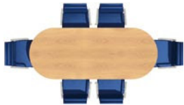
Size: 2500 x 1000mm Seats: 6