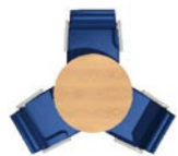
Size: 800mm diam. Seats: 3