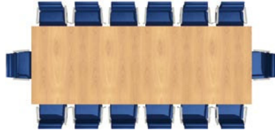
Size: 4250 x 1500mm Seats: 14