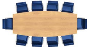
Size: 3000 x 1200mm Seats: 8/10