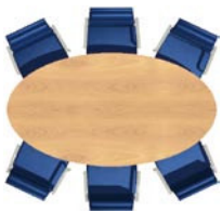
Size: 2200 x 1200mm Seats: 6