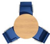
Size: 1000mm diam. Seats: 3