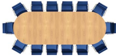
Size: 4250 x 1500mm Seats: 12/14