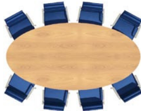
Size: 3000 x 1500mm Seats: 8/10