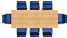
Size: 2500 x 1000mm Seats: 8